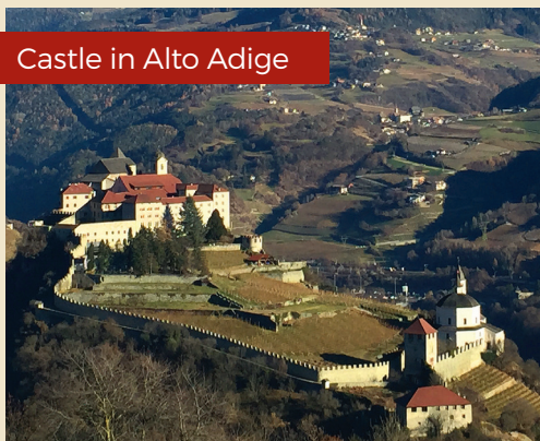
Castle in Alto Adige

In the morning we will check out and head to the beautiful Lake Garda! We will first stop and see the Varone Waterfall Park and then arrive in Riva del Garda for a lunch close to the water. After lunch, we will have time to walk around the beautiful little town or do the panoramic trail along the lake called