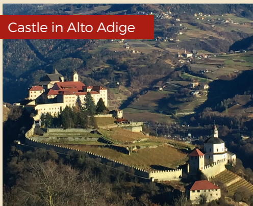
Castle in Alto Adige

In the morning we will check out and head to the beautiful Lake Garda! We will first stop and see the Varone Waterfall Park and then arrive in Riva del Garda for a lunch close to the water. After lunch, we will have time to walk around the beautiful little town or do the panoramic trail along the lake called